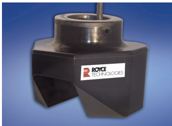
MODEL 72A LOW RANGE SENSOR

Model 7110 and Model 7120 can use any of the Royce Series 70 TSS Sensors. Some examples are shown below.