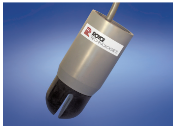
MODEL 73B MID-RANGE SENSOR