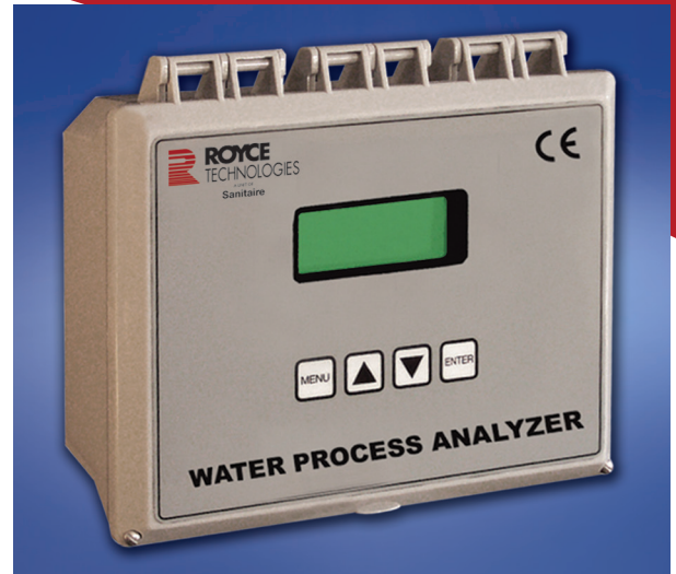
MODEL 7110/7120 SINGLE & DUAL CHANNEL ANALYZERS

(8182)63-90-72 +7(7172)727-132 (4722)40-23-64 (4832)59-03-52 (423)249-28-31 (844)278-03-48 (8172)26-41-59 (473)204-51-73 (343)384-55-89 (4932)77-34-06 (3412)26-03-58 (843)206-01-48